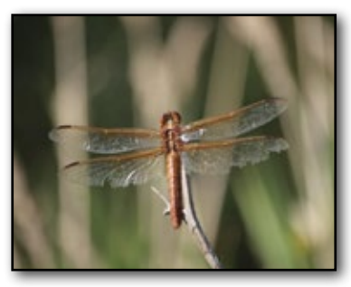
Flame Skimmer Dragonfly

That day, 245 photos were taken and 128 species were identified. Birding highlights included solitary sandpiper, warbling vireo, common nighthawk, and western grebe. We also detected some unusual plant species that haven't been observed on the preserve for a number of years, including Arizona centuary and grand redstem. Tamarisk beetles, a biocontrol against tamarisk, were located in the area where they have never been released, presumably by migrating up the river corridor and onto the property.