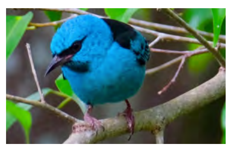
A brilliant Blue Dacnis observed on the Costa Rica Trip.

The Tarcoles River was teeming with species, including Boat-billed Herons and American Crocodiles. Holbrook Travel provided all of the 12-person group's needs, including the guide, food, hotel and flight arrangements. Costa Rica felt very safe because each citizen wore masks and washed their hands. They were slowly bringing their vaccination counts up as we visited their country.