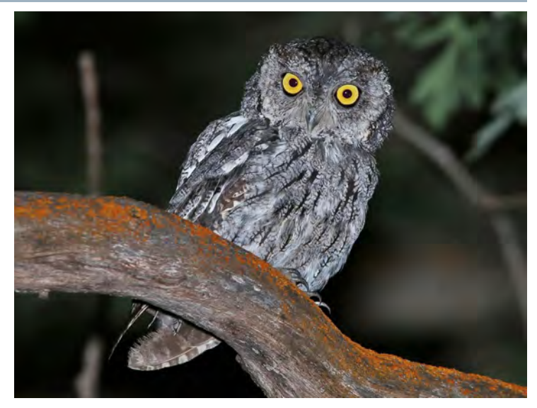
Western Screech Owl